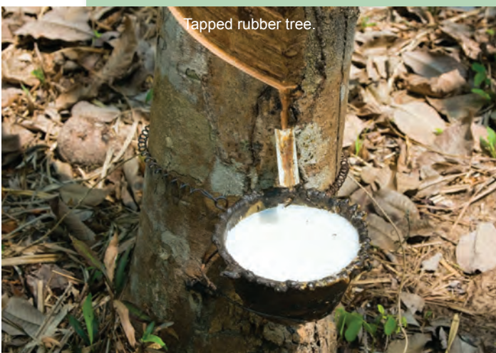
Tapped rubber tree.

Trees from the family Euphorbiaceae are a group that produce a sticky milky sap that is described as a colloid solution . This means a solution with insoluble particles suspended in it, much like milk. We have been using rubber for a long time and it is thought that rubber from trees was first used in 1600 BC to make a ball for a traditional Mayan game. Natural rubber in the right conditions will never decompose but humans haven't been using it long enough to test this fact. 81% of the world's natural rubber comes from the following countries: Thailand, Indonesia, Malaysia, India, China and Vietnam.