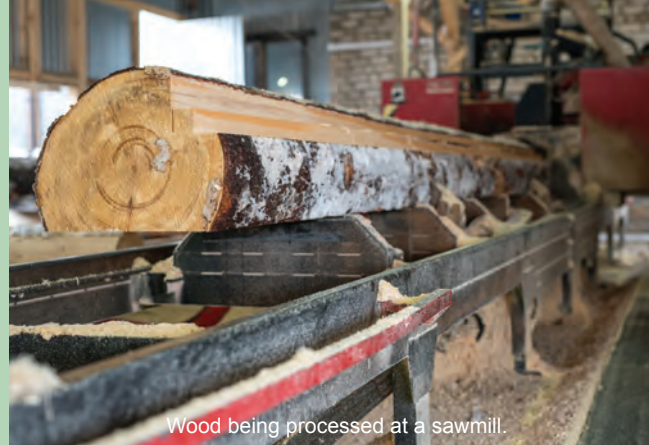
Wood being processed at a sawmill.