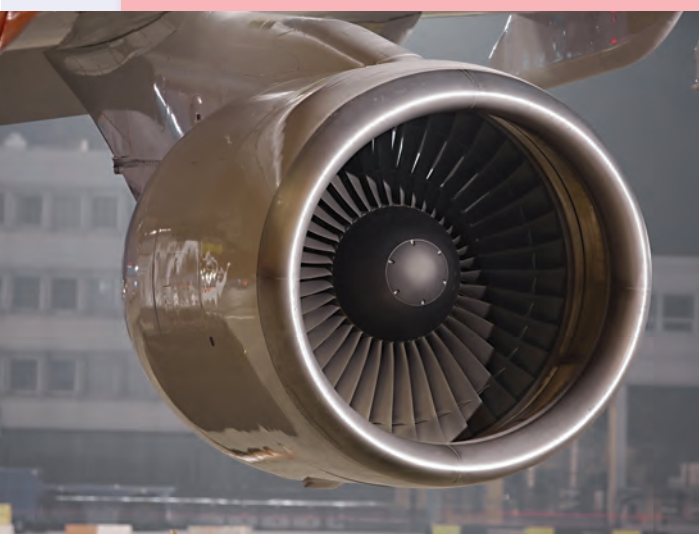
Molybdenum is used in aircraft engines.

Molybdenum is a little known element, that rarely makes it into daily conversation but just remember, without it, life wouldn't be the same. So next time you sit down with a bowl of rice to watch TV pay a little tribute to mighty molybdenum.