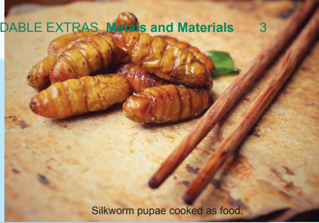
Silkworm pupae cooked as food.

The production of silk has come under some controversy in recent years. Animal rights groups like PETA are against the production, use and wearing of silk because the silkworm pupa are killed in the silk-making process and it has been compared to fur products. They recommend the use of alternative fabrics that don't require the death of the animal, such as wool or plant based fabric like cotton and linen.