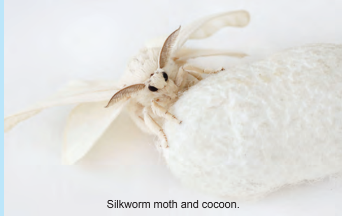
Silkworm moth and cocoon.