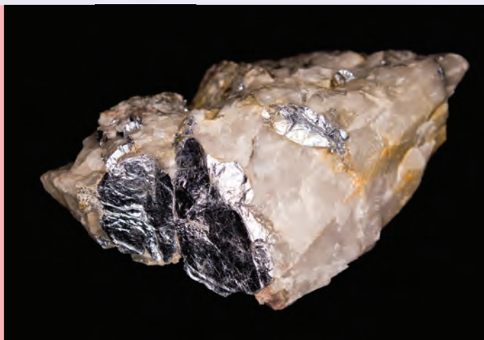
Shiny silver flakes of molybdenite ore on quartz.

The rock containing molybdenite is blasted using explosives. The rock only contains a small amount of molybdenite which has to go through a long process of extraction . In fact one tonne of rock only gives up to 1.8 kg of molybdenum. The blasted pieces are taken to a crusher where they are broken down into even smaller bits. These are then taken to grinding mills where they are pounded and pulverised until the particles are the size of sand. Once mixed with water, a slurry is made which is piped onto the next stage of extraction, the flotation . This is where chemicals are added that make the molybdenite become hydrophobic (water hating) so it tries to get away from the water it has been mixed with, causing it to float on the surface. Air is then pumped in to make bubbles which the molybdenum sticks to get it farther away from the water. These bubbles rise to the surface and are skimmed off. The skimmed bubble concentrate is then dried into huge heavy blocks of grey-black powder which is almost pure molybdenum. A further step where the molybdenum is heated to 650°C results in it becoming as close to 100% pure as possible.