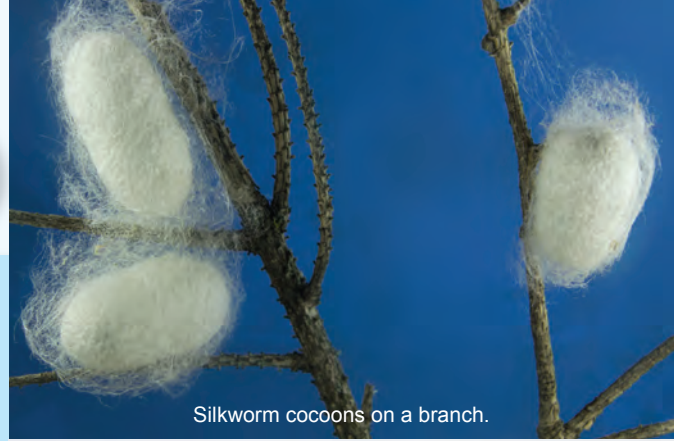
Silkworm cocoons on a branch.

Silkworm farmers don't want the moths to secrete the enzymes because they destroy the silk and cut it into small pieces. This silk can still be used for stuffing pillows and duvets but it is not worth as much money as it can't be spun into a thread for weaving. To stop this from happening, the farmers either put a pin into the pupae's head through the cocoon to kill it or they boil the pupae and cocoon in water, which also kills them. The boiling water also makes the silk easier to unravel. Each cocoon can contain silk in a single strand of up to 900 m. The silk is then spun into threads and woven into fabric. The pupae from inside the cocoons are