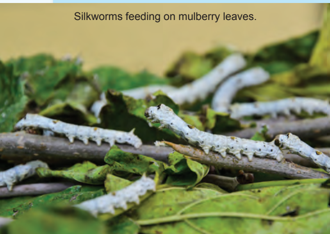
Silkworms feeding on mulberry leaves.

Bombyx mori or the Silkworm of the mulberry tree is the main domesticated silk producer. It is farmed following a very specific method and there is evidence that this insect has been farmed for over 5000 years. The moth of the Silkworm is a large white or silver grey hairy insect with a 5 cm wingspan. Despite these large wings, they can no longer fly. Females are slightly larger than males as they have to carry the eggs.