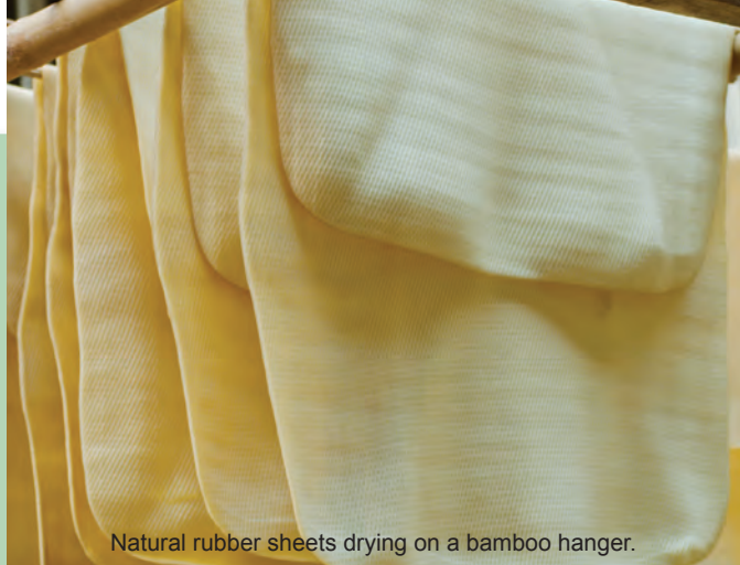
Natural rubber sheets drying on a bamboo hanger.

Other non-natural rubber is made from petrochemical sources which has its origins in oil. Due to the amount of oil on Earth diminishing rapidly, other sources are being sought that could keep some of the pressure for rubber off the rubber trees. Dandelions contain some latex in the milky white sap of their roots but it is in tiny amounts. German scientists have recently produced tyres from dandelion rubber using a newly developed technique.